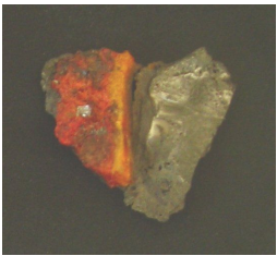
Sue Coulson | 2 fragments of (hu)man manufacture from a lost world | Mixed media

No walk is straightforward – between moments of idle thought and contemplation decisions have to be made.